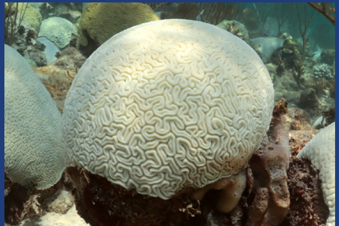
A piece of brain coral completely bleached.