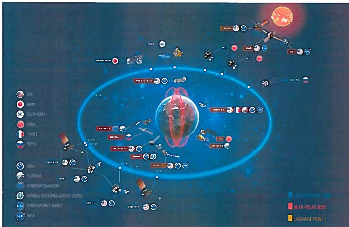
Figure 2. Existing global space-based assets making space weather observations. Solar and space environment measurements are obtained by numerous domestic and international partners on platforms in different orbit planes.

A current array of space observing assets provide information in support of current national and user needs, but it is an ad hoc collection of U.S. and international research and operational assets. Importantly, in some critical observation and measurement areas the system provides no resiliency, relies on assets decades beyond the mission design life, and lacks follow-on capability. Figure 2 provides an overview of current assets supporting the space weather mission; assets include spacecraft in LEO, GEO, and at L1 (the closest stable orbit point upstream toward the Sun along the Earth-Sun line). NOAA has agreements with many but not all of these missions for real time access to the data for operational use. NOAA is evaluating additional agreements for those systems which are not yet integrated into the global observing system network.